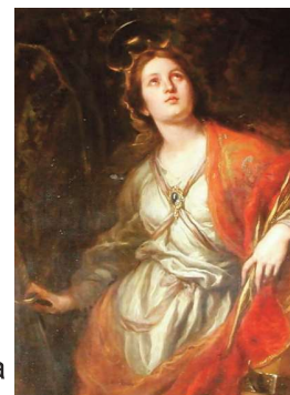
St. Catherine of Alexandria